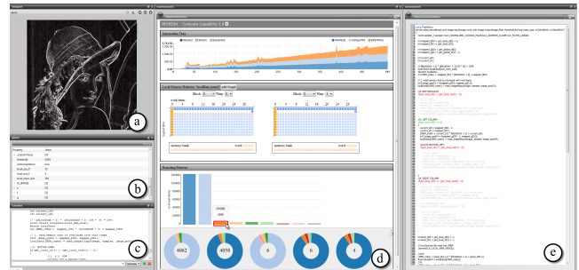
Figure 1: The interface of our integrated system: (a) shows a domain view that depicts the output of a Sobel filter and highlights corresponding to the hovered visual element, (b) shows a global variable view, (c) shows a console, (d) shows the visual explorer with different analysis views, (e) shows the source code editor with highlights that also correspond to the hovered visual element.

Visualization Framework: The resulting data that was generated during the execution of the kernel is visualized using a powerful framework capable of static as well as interactive visualizations. By linking the visualizations with source code, we provide insight into the program's structure, execution, and memory access patterns.