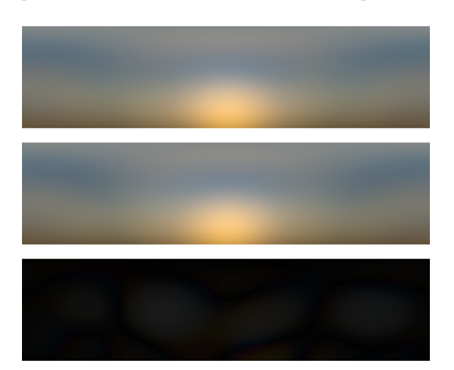
Figure 2: Worst case reconstruction (N = 7, \theta = \pi/2 , \tau = 6 ) with the correct extension (top), the reconstructed signal (center) and the difference (bottom).

Considering normalized surface SH weights, equations 2 and 3 are overestimates of the upper bound since a surface point never sees the whole environment. In our implementa-