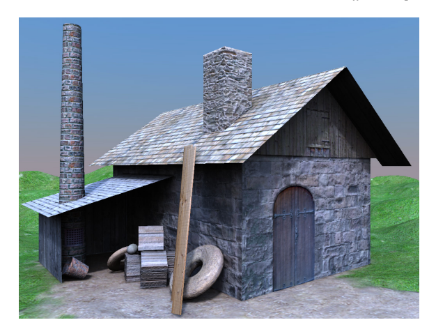
Figure 1: Scene lit with daylight configuration

Taking advantage of their orthogonality, the radiance transfer is evaluated using the inner product of the spherical harmonics weights calculated from a dynamic lighting environment and the precomputed weights on the surface or volume in real time. We would like to refer to [SKS02] and [DV04] for a detailed description of the method. The proposed method is concerned with the efficient reconstruction of a parameterized environment in its spherical harmonics representation.