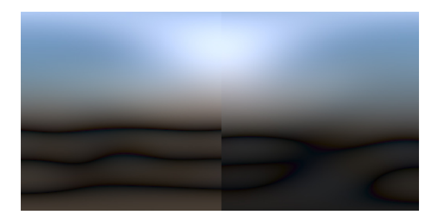
Figure 4: Original (left) and filtered (right) spherical harmonic reconstruction. The ringing artifacts from the horizon are strongly reduced.

memory resources needed are negligible compared to any other part of a graphics pipeline (the computation is done only once per frame).