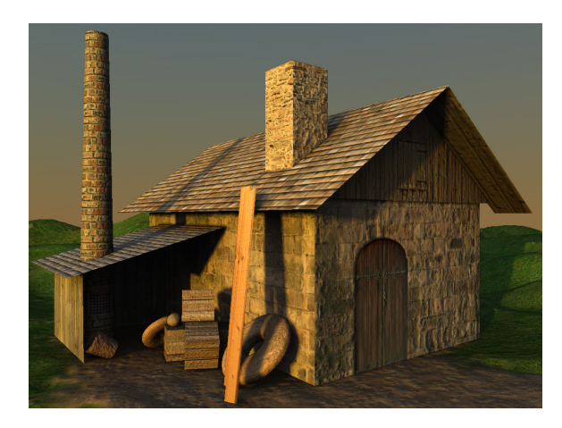
Figure 5: Scene lit at sunset.

We provide the resulting data for the case of the Preetham skylight model as C-arrays in conjunction with a full implementation of the proposed method [XX007], which is ready to be used in any spherical harmonics setup. Figures 1 and 5 show a scene lit with the proposed method using 5 SH-bands. This combines naturally with a directional sunlight, soft shadows and a Reinhard tone mapper [Rei02] for a full sky representation and high dynamic range reproduction. We would like to refer to the accompanying video for a visualization of this combination of techniques.