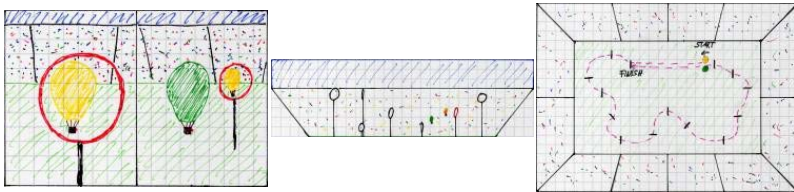
Left: View while playing, Middle: side view (not visible in game), Right: top view (not visible in game)